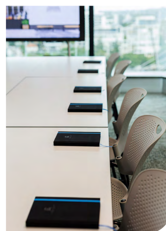
Tabbil training room