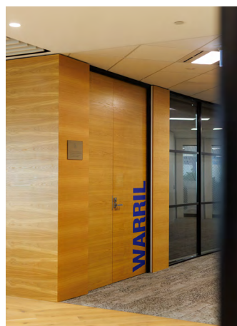
Warril training room